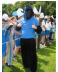
Cheering on the winners - Simpson house!

Castlebrook held their annual Sports Day in July. The whole school competed against each other in their various houses and an excellent day was had by all. The event gave the learners a sense of community and it was an excellent way of promoting the house system.