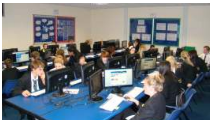
Year 10 Stock Market Challenge in the Independent Learning Zone

Learners enjoy the team work aspect of the challenge and gain experience from using and applying maths, interpreting media (news, papers, radio coverage) and decision making skills.